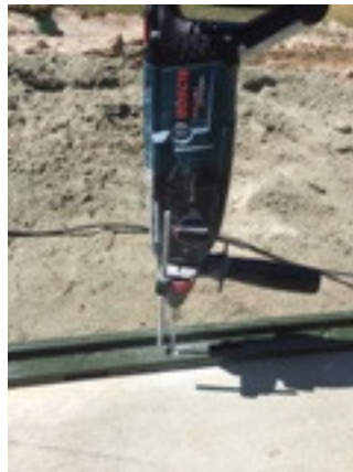
Drill hole through grommet hole to secure frame