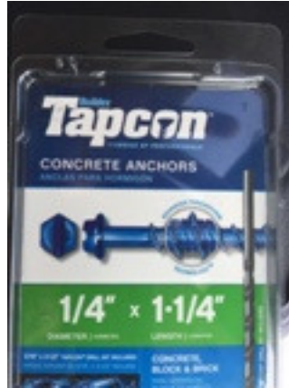
Installation Tapcon Home Depot - Option 1