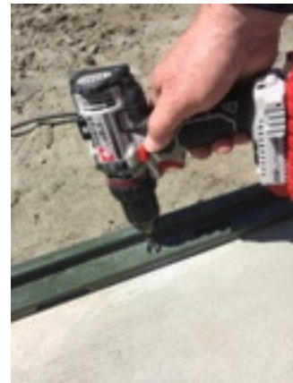
Screw in Tapcon 1.25 in.