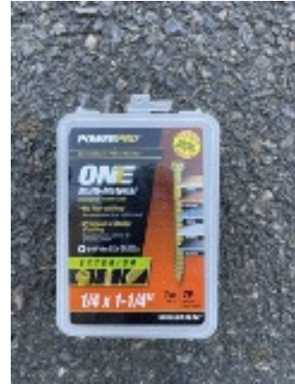
Power Pro One Tapcon Lowes - Option 2