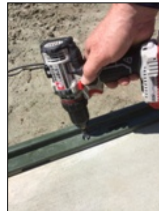
Screw in Tapcon 1.25 in.