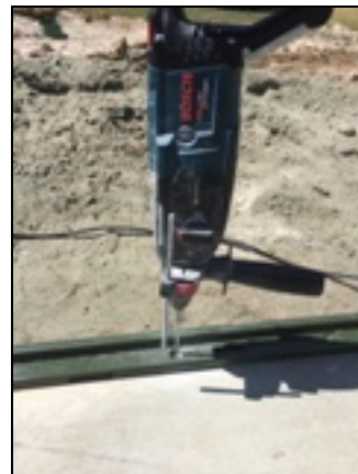
Drill hole through grommet hole to secure frame